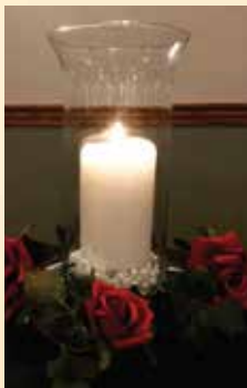
Cylinder with Lip