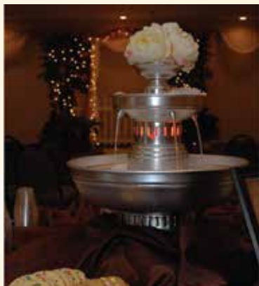
Champagne Fountain $40.00