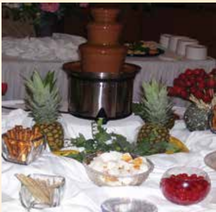
Chocolate Fountain $100