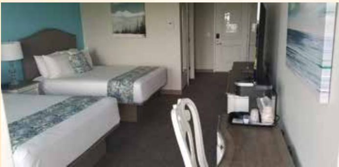
Double Queen Room