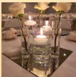
Mirrors- $1.00 12x12