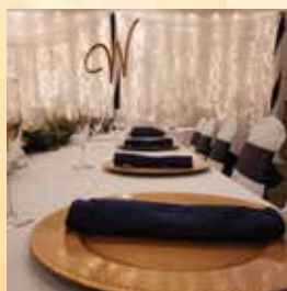
Charger Plates - $1.00 Available in Red, Gold, Silver, and Rose Gold