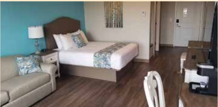
Single Queen Suite

Each room is equipped with: a 65" Smart TV, Mini Refrigerator, Microwave, and Keurig.