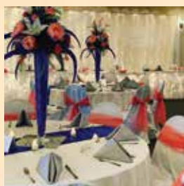
Runners/Overlays- $2.00 Ask for additional colors