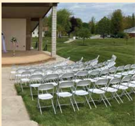
White Folding Chairs $1.50 per chair