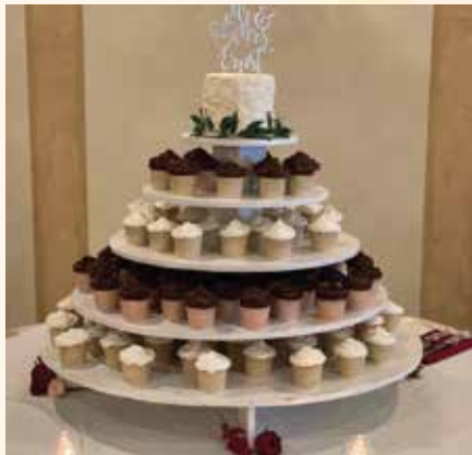
Cupcake Stand $25.00