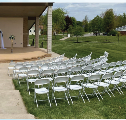
White Folding Chairs $1.50 per chair