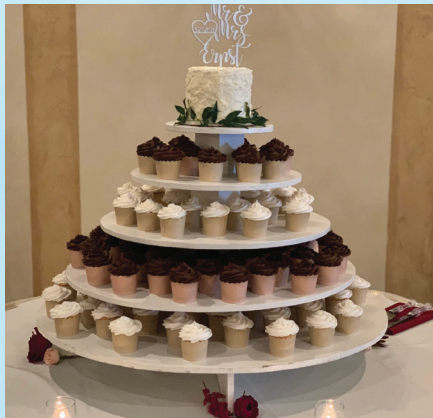
Cupcake Stand $25.00