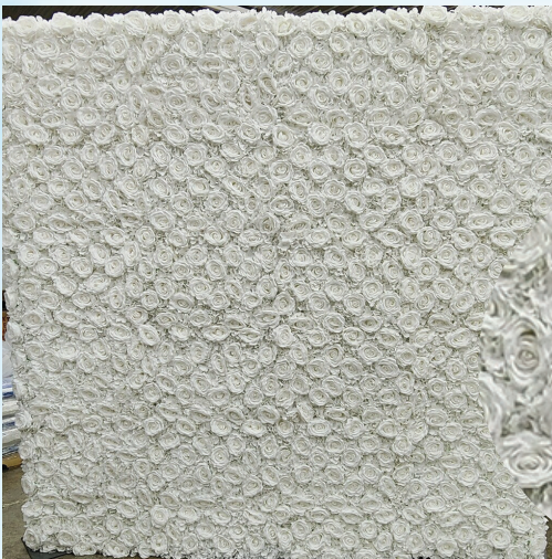
White Rose Wall - $200 8'x 8'