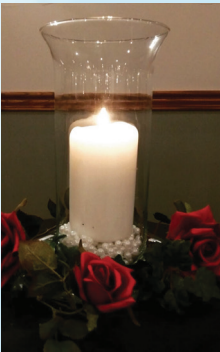
Cylinder with Lip