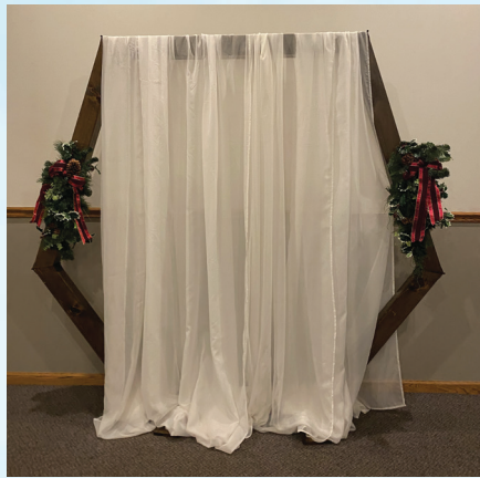
Hexagon - $150