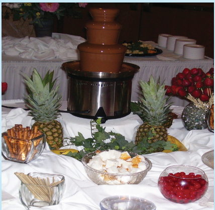
Chocolate Fountain $100