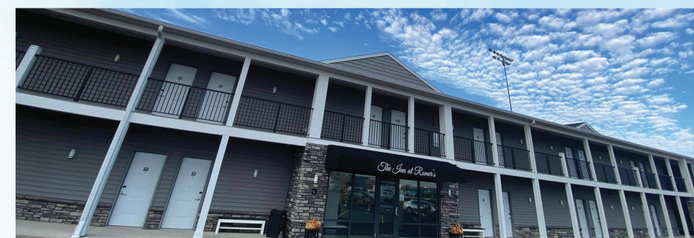
Single Queen Suite

Each room is equipped with: a 65" Smart TV, Mini Refrigerator, Microwave, and Keurig.