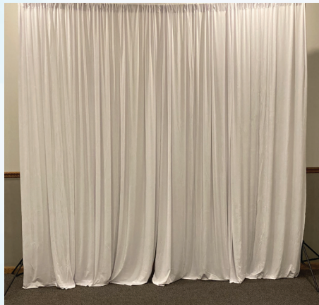
Stretch Curtain - $50