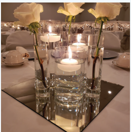
Mirrors- $1.00 12x12