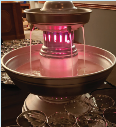
Champagne Fountain $40.00