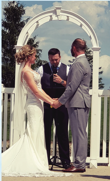
White Arch - $25