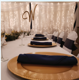
Charger Plates - $1.00 Available in Red, Gold, Silver, and Rose Gold